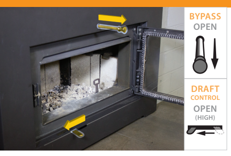
1) Before starting a fire, open the bypass damper , and fully open the draft control.