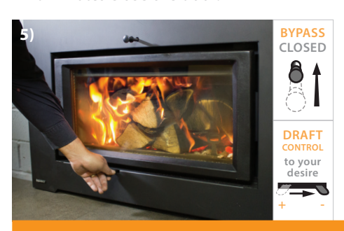
5) Adjust the draft control for desired burn rate.