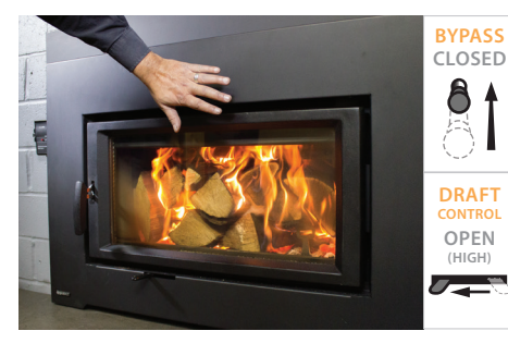
4) Once the fire becomes established add large logs to the firebox until it is fully loaded. Typically, after 20-30 minutes you should be able to close the bypass damper as temperatures will have reached the "active" zone (beyond 500° F, 260° C).