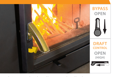
2) Using dry kindling and rolled newspaper, build a fire base as normal, and ignite leaving the door slightly open.